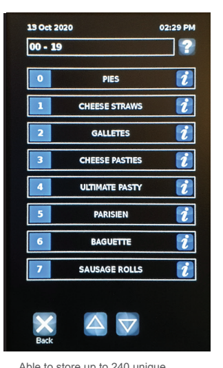
Able to store up to 240 unique baking programmes.