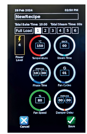
Recipe programme showing Fan Speed Setting.