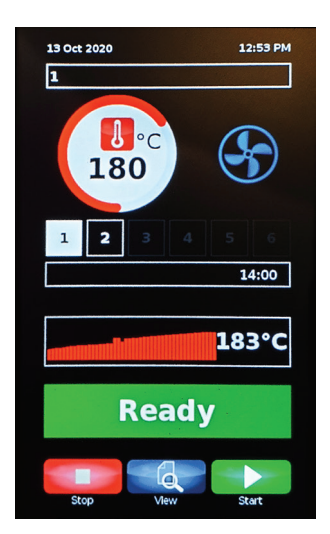
When the oven is at the desired temperature the ready screen will be displayed.