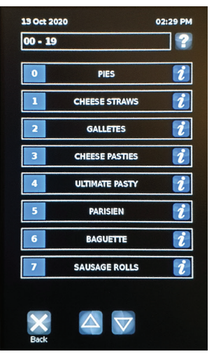
Able to store up to 240 unique baking programmes.