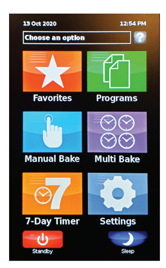
High definition touchscreen controller.