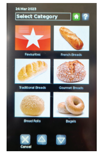
Option to have pictorial or numerical programme screens.