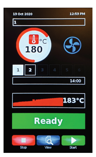
When the oven is at the desired temperature the ready screen will be displayed.