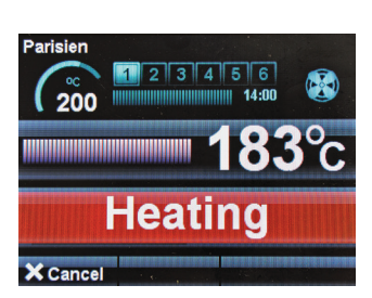
The heating screen shows the temperature progress.