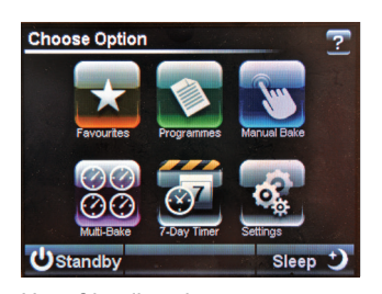
User-friendly color touch controller.