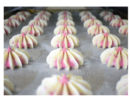
2 Colour Star Flower Drop