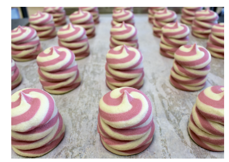
2 Colour Multiple Drops with Alternate Twists