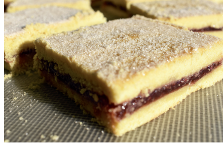
3 Layered Sheeting in 1 Pass