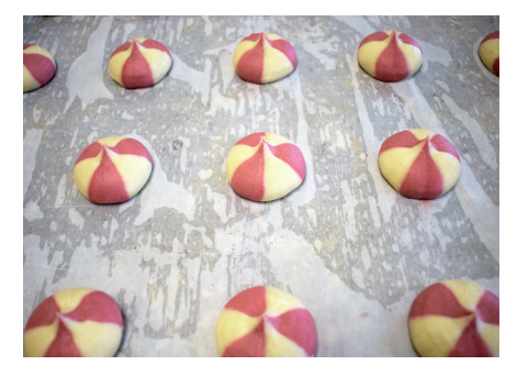
2 Colour Segmented Drops