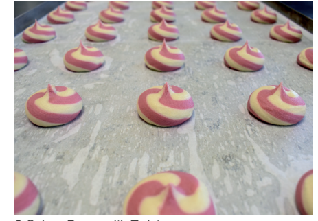
2 Colour Drops with Twist