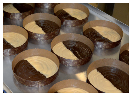
2 Coloured Sponge Cakes Half-and-Half