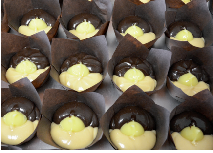
3 Colour Cupcakes