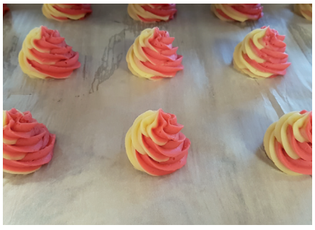
2 Colour Rose wth Twist