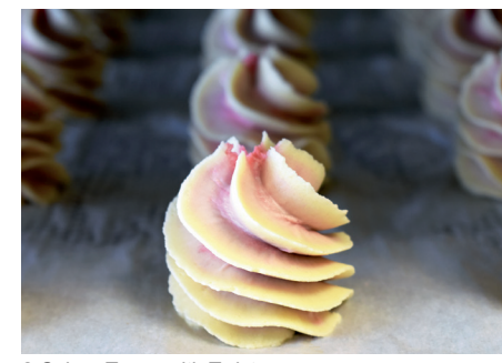
2 Colour Tower with Twist