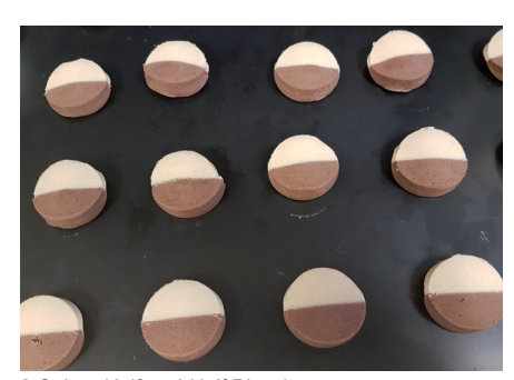
2 Colour Half-and-Half Biscuits