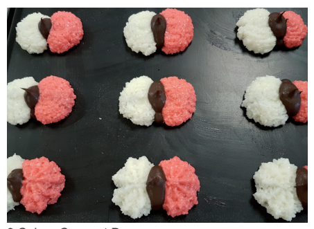
3 Colour Coconut Drops