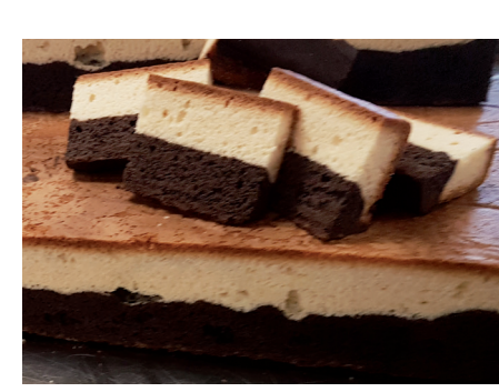
2 Coloured Layer Cake in 1 Pass