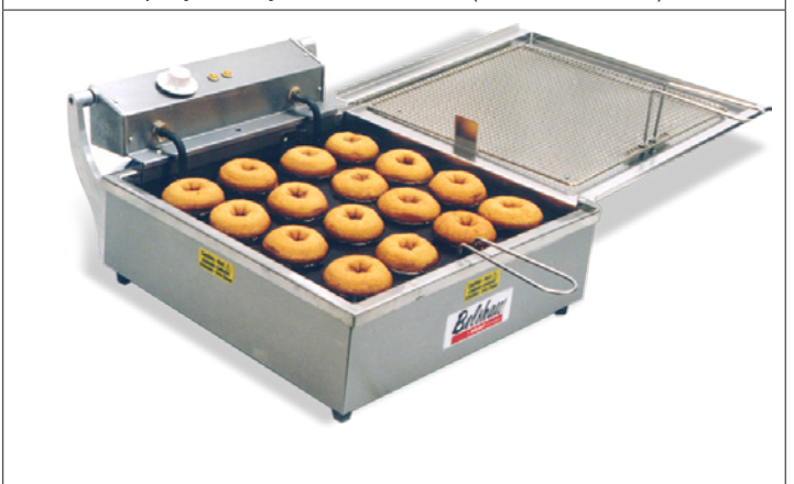
616B Tabletop Fryer with cake donut