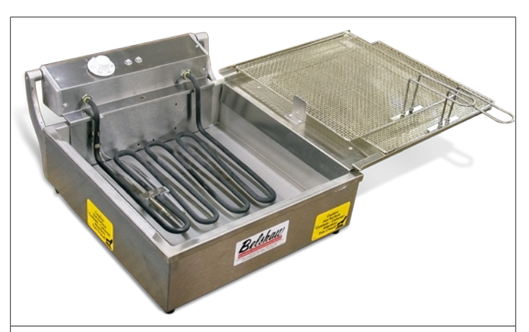
616B Tabletop Fryer