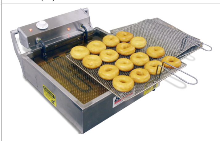
616B Tabletop Fryer with yeast-raised donuts (with extra screens)