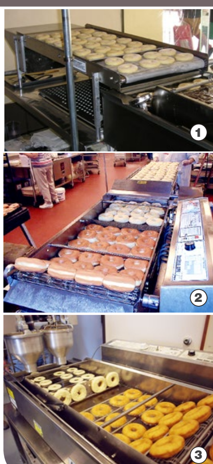
Above: 1– Feed Table 2– Standard Mark VI system with Feed Table 3– Mark VI with automatic cake donut depositing

Production capacity is estimated at 95 seconds frying time. Production rate will vary depending on percentage of capacity used and other factors.